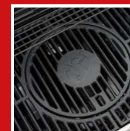
Enamelled cast-iron racks with Modulus system