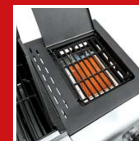
maxX zone: for searing at up to 800°C